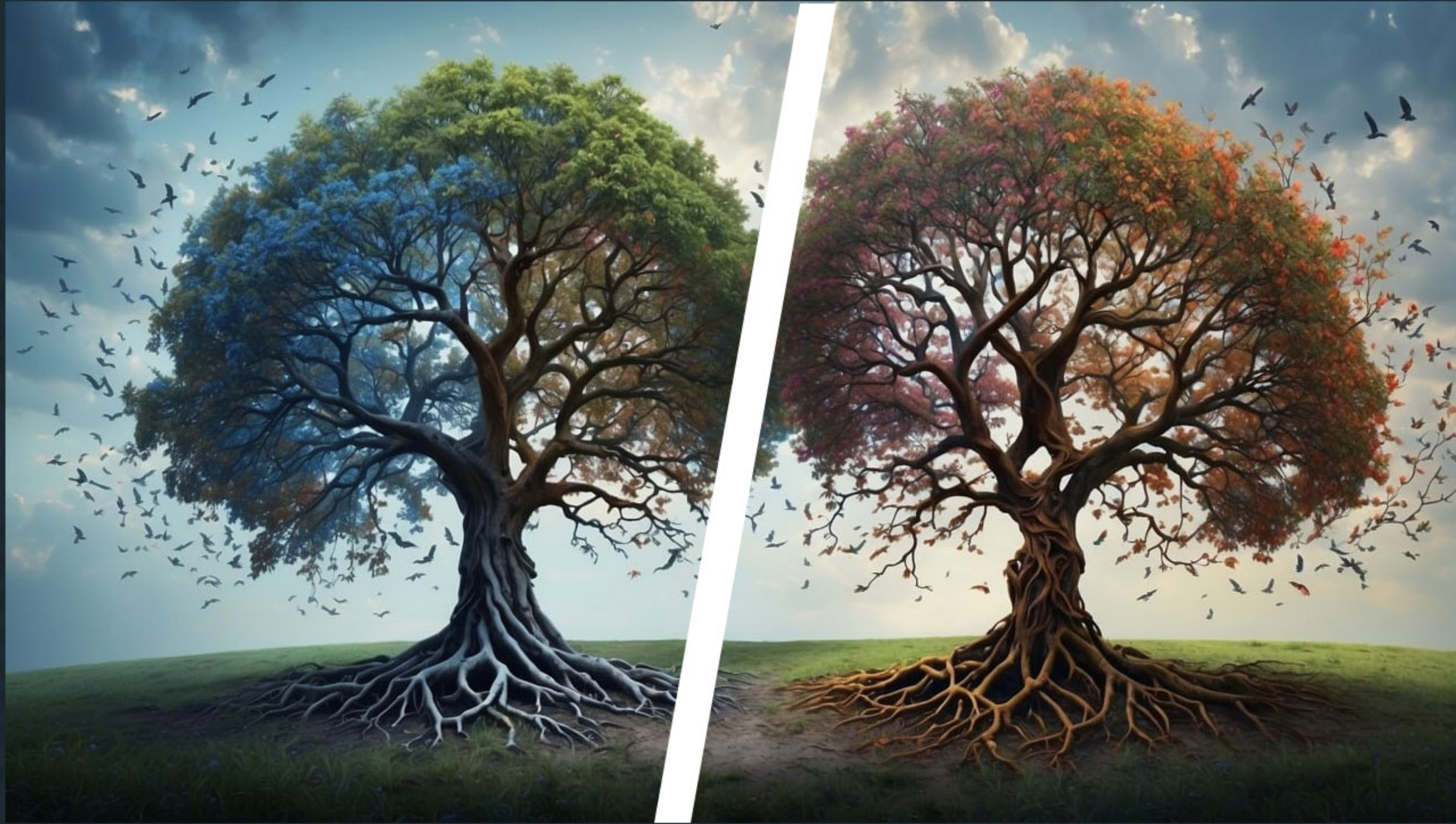
TREE OF LIFE